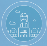
LAKE SHORE CAMPUS

At Loyola, you'll experience the best of both worlds : an immersive traditional campus plus the professional and recreational opportunities of a big city.