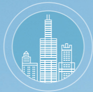
WATER TOWER CAMPUS

At Loyola, you'll experience the best of both worlds : an immersive traditional campus plus the professional and recreational opportunities of a big city.